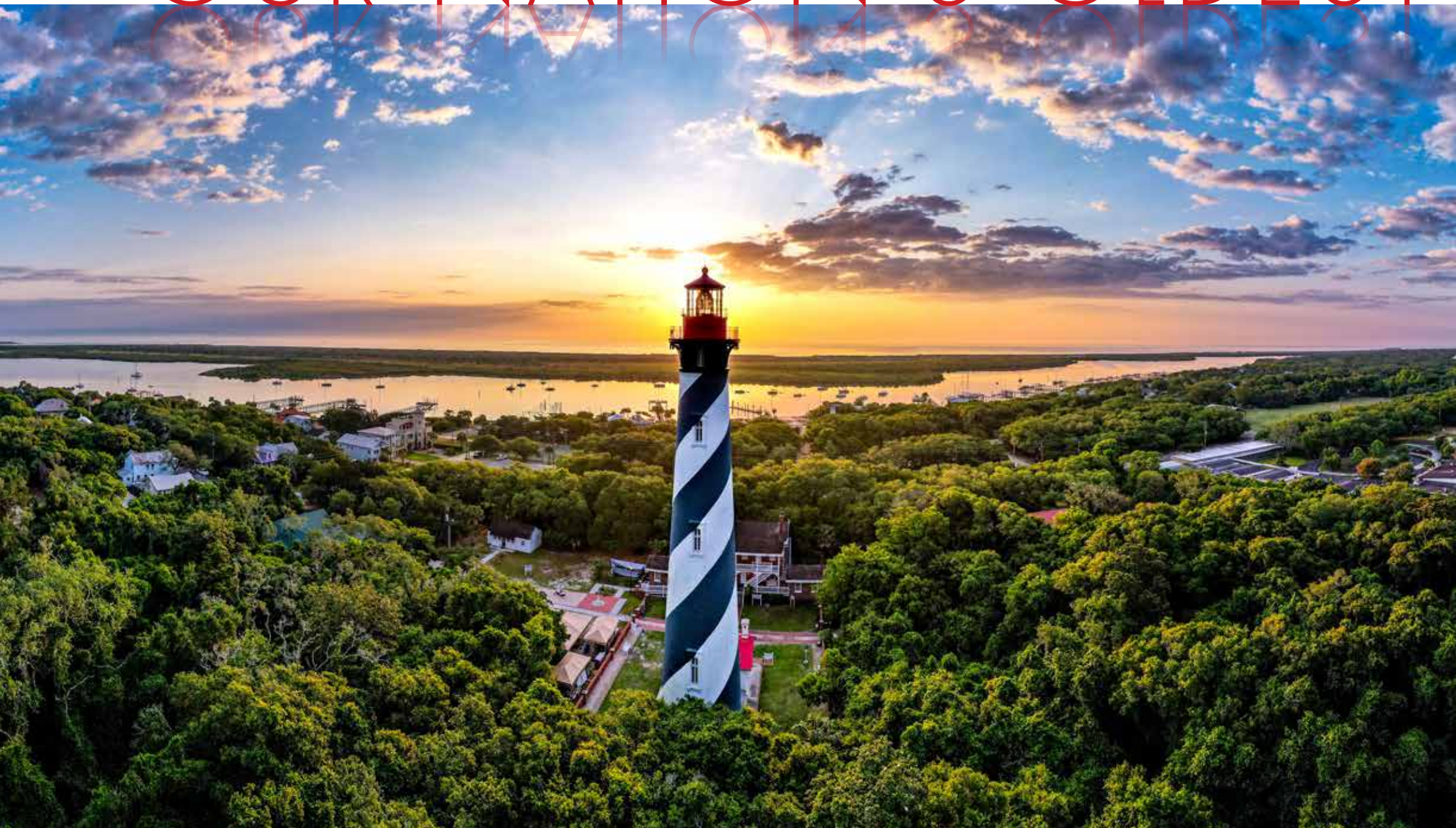
▲ Anastasia Island and the St. Augustine Lighthouse

Towering over the oak trees which it has watched grow, the St. Augustine Lighthouse with its iconic black and white swirled exterior and fire engine red top stands resolute over Anastasia Island. This current structure, one of a line that extends back to at least the 1580s, may be more than 145 years old, but it's still used today as a navigational aid for maritime vessels journeying to and from our nation's oldest port. The property is now listed in the National Register of Historic Places, and the museum is accredited through the American Alliance of Museums and is a Smithsonian Affiliate Museum. To learn the history of the lighthouse is to discover how fraught with danger and uncertainty life was for the people of St. Augustine.