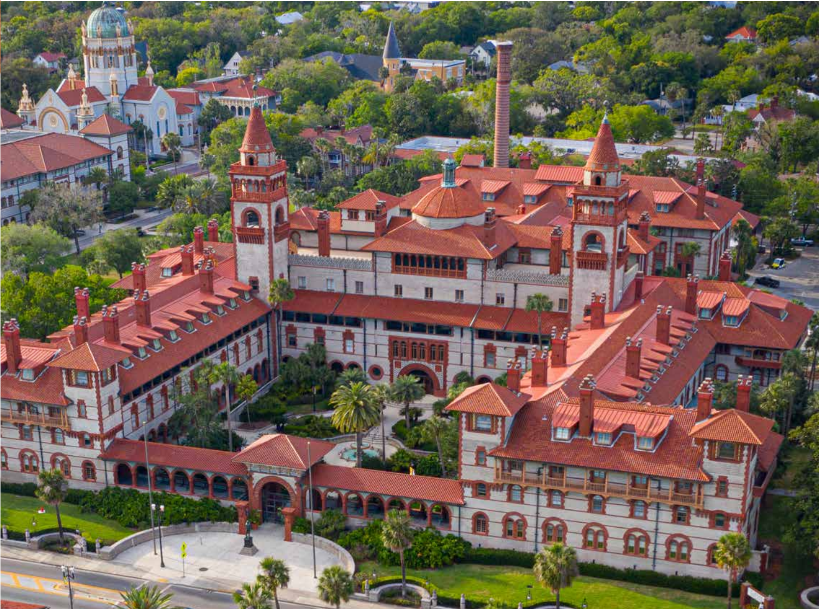
▲ Statue of Henry Flagler ◀ A Tiffany stained glass window at Flagler College Flagler College campus with Memorial Presbyterian Church top left