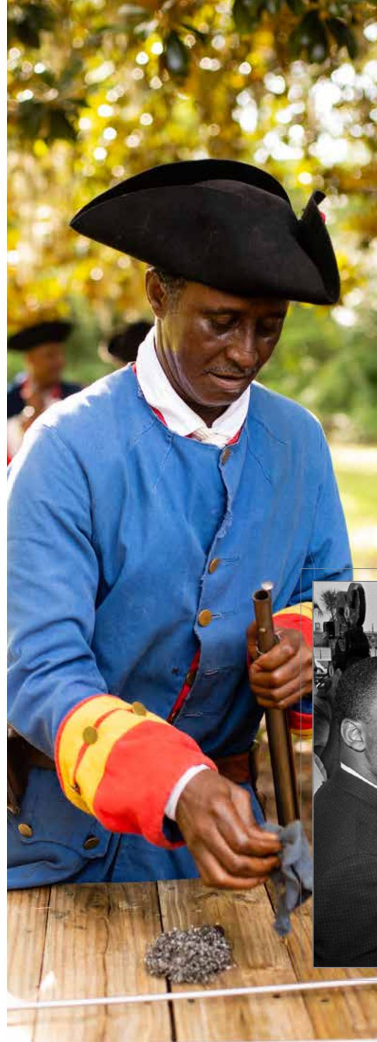
Re-enactor at Fort Mose Historic ▶ State Park

history and women's history." It also portrays the once-vibrant cultural and social life of the Black middle class in Lincolntonville, Butler Beach and beyond. "My father owned jukeboxes all around the county. When I accompanied him on his rounds, I saw successful Black businesses, clubs and social establishments like Odd Fellows Hall, places that most people don't know existed. The museum tells that story too."