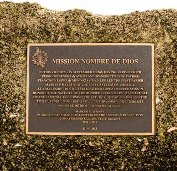
▲ The Shrine of Our Lady of La Leche