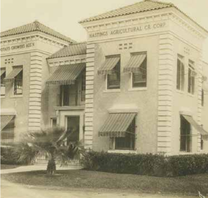
▲ Hastings Potato Growers Association building

Realizing the need to form a collective bargaining organization that could leverage and negotiate the best prices for the potatoes, several smaller cooperatives merged in 1922 to form the Hastings Potato Growers Association, making the community the Potato Capital of Florida. The association’s building, erected in 1927, still stands proudly on the town’s main street as a testimony to this important chapter in Hastings history.