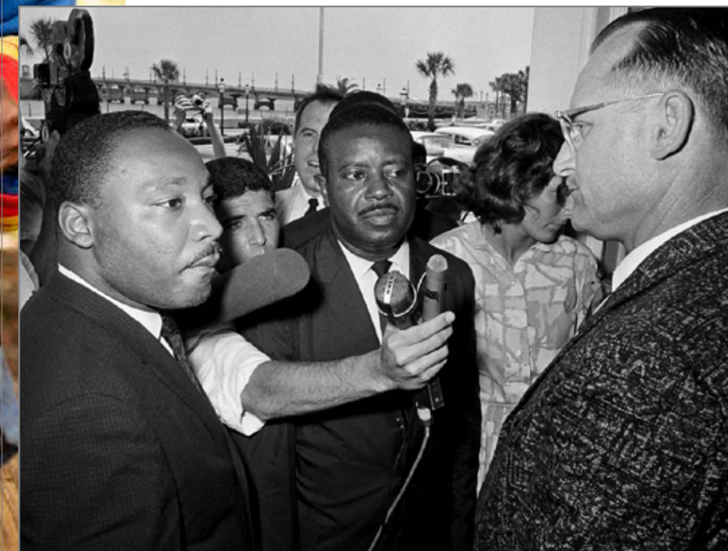
▼ Dr. King and Rev. Ralph Abernathy (center) were refused entry into The Monson Motor Lodge's restaurant and then arrested